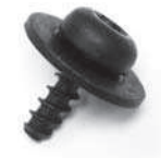
700-701 cowl grille screw