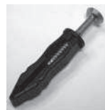
700-709 cowl grille retainer